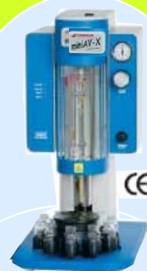
CANNON MiniAV™-X Automatic Viscometer

Unit 4c, Hunmanby Industrial Estate, Hunmanby, Filey North Yorkshire, YO14 0PH Tel: +44(0)1723 892262 Fax: +44(0)1723 890972 Sales@labplant-zematra.com www.labplant.com (Products : Labplant-Zematra)